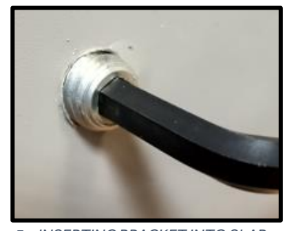
3 – INSERTING BRACKET INTO SLAB

3 – Using an 8mm Hex key (Allen key) insert and tighten the _____ until it sits flush with the door slab.