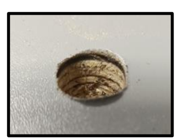
2-DRILLING INTO SLAB

(Taking extra care not to damage the slab whilst drilling)