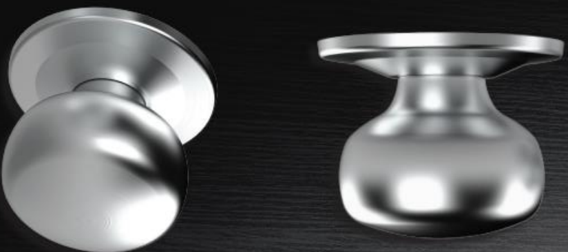
STAINLESS STEEL DOOR KNOB