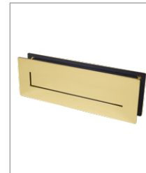
PPB Polished Brass - PVD Stainless Brass