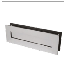
PSS Polished Stainless Steel