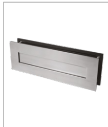
SSS Satin Stainless Steel