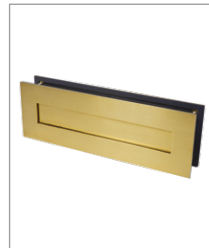
PSB PVD Satin Brass