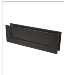
TMB Textured Matt Black