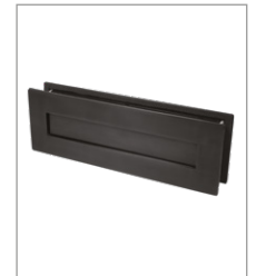
PBK PVD Satin Black